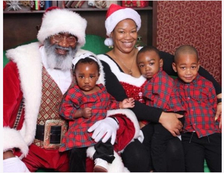
Christmas Family Photo 2025

In February, after months of waiting, she got the call. Her family had been approved for housing.