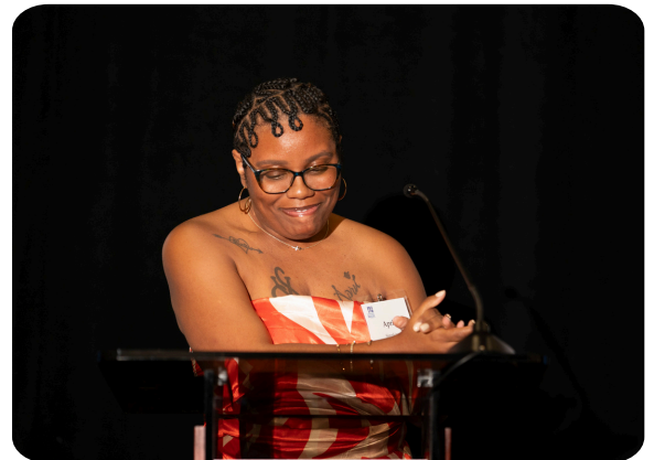
2025 COMMUNITY OF HOPE CLIENT SPEAKER