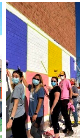
Volunteers from our architects at Densler decorate the old building before construction.