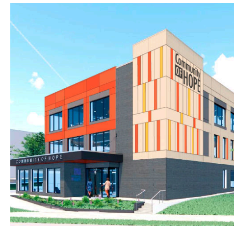
Our New Health Center

In January 2021, construction to transform this two-story building on Bladensburg Rd., NE into our expanded and relocated Family Health and Birth Center began. We look forward to opening this health center – that is over twice as large as our current location – in early 2022 and to continuing to be a haven for family medical, emotional wellness, and maternal and infant health on the eastern side of the city. Learn more at www.communityofhopedc.org/newfhbc .